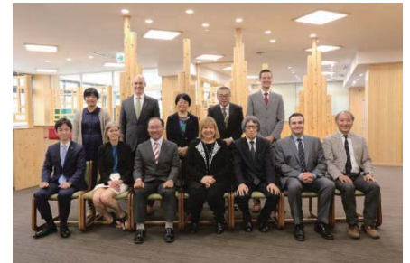
〈 Canadian Minister visiting Okayama University 〉