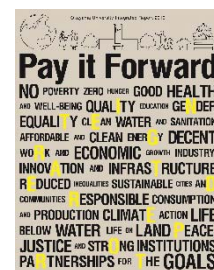
〈 Okayama University Integrated Report 2019 —Pay it Forward—(in English) 〉

To mark its release, Okayama University Integrated Reporting Forum 2019 was held, attracting approximately 200 participants, including alumni and students of the University, high school students, those from other universities and companies, and local residents.