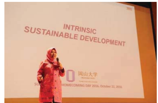
〈 Commemorative lecture held on the Super Global Homecoming Day 〉

In October 2016, we organized the Super Global Homecoming Day. Inviting branch managers of the International Alumni Association to Okayama University, we requested them to cooperate in accepting many more international students, and held a commemorative lecture.