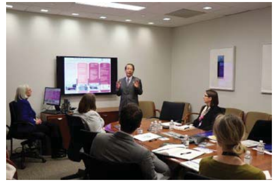
〈 Visit to the ECA of the U.S. Department of State 〉