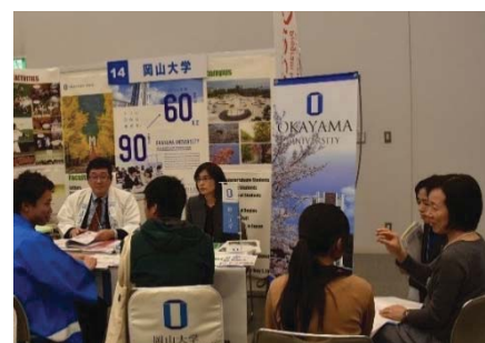
〈 Discovery Program for Global Learners' public relations activity for the 3rd GO Global Japan Expo 〉

We joined study abroad events and visited overseas high schools for public relations and recruitment activities. Moreover, we kept track of overseas demand for manpower and necessary expertise and skills. Furthermore, we developed curriculums for training personnel with practical skills that will have high educational effects and match the needs of students and society, and an entrance examination system for selecting applicants who are qualified for the program.