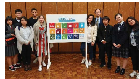
〈 Debrief meeting of Okayama University "Tsuyama Ideathon" 〉

As of March 2020, 142 students from 25 countries (including Japan) have joined the Discovery Program for Global Learners. Our students are guided by a diverse faculty consisting of 14 dedicated members from 5 countries (including Japan). As part of their university coursework, a group of 27 Japanese and international students participated in the Okayama University "Tsuyama Ideathon," an event to discuss the application of the SDGs in our local community. At a debriefing attended by Tsuyama City government officials, members of the Tsuyama Tourism Association and Tsuyama Chamber of Commerce and Industry, NPO representatives, local residents, as well as local high school students and teachers, GDP students presented various ideas that they had developed at the Ideathon, including a hands-on museum or café that incorporates the unique history and culture of Tsuyama, environmental conservation activities, and support for local entrepreneurs.