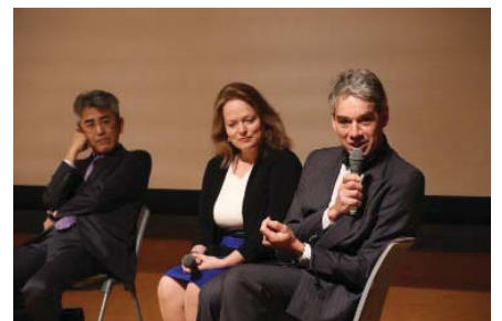
〈 At a panel discussion held at the symposium commemorating the establishment of the Discovery Program for Global Learners 〉

Furthermore, we received request statements indicating the importance and necessity of establishing the graduate school, not only from Okayama City and the Okayama Association of Corporate Executives, but also from the city of San Jose, California and the Japan Business Society of Detroit, Michigan, both in the U.S. In March 2017, we submitted our establishment planning documents, together with these request statements, to the Ministry of Education, Culture, Sports, Science and Technology.