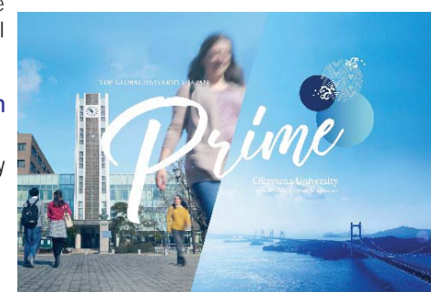
〈 "Top Global University Project" Brochure (in English) 〉