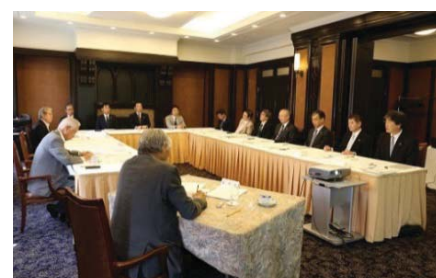
〈 Meeting of the external evaluation committee 〉

Moreover, we will hold a Graduate School of Medical and Health Sciences Integrated with Humanity and Technology (provisional name) workshop in academic year 2016.