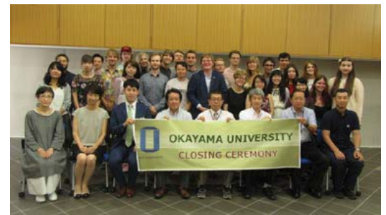
〈 Presentation Session and Program Completion Ceremony 〉