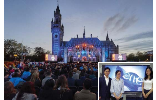
〈 An opening ceremony was held at The Hague, the Netherlands 〉