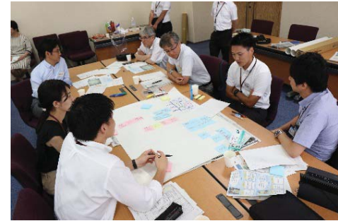
〈 Young employees working in a group 〉

The 2nd session of the workshop was held with the topic of the U.N.-proposed SDGs (Sustainable Development Goals), in collaboration with Okayama University SDGs Planning Committee. The objective of the session was to understand the University's advantages and look at the future of the University. In the session, participants performed group work with Committee members, referring to examples of approaches to promote SDGs. Also, specific themes to be addressed to promote the University's SDGs Initiatives were given to participants, who gave presentations on the kinds of problems that would arise in addressing the themes and how to solve them.