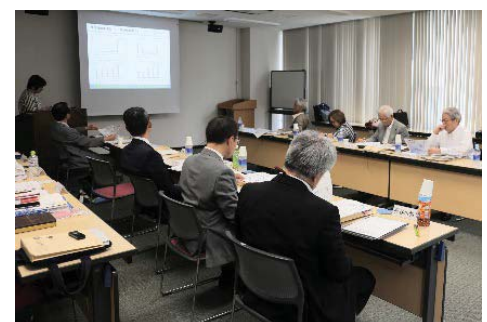
〈 During the Q&A session 〉