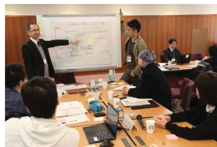
〈 Okayama University Future Session 1-1 〉

Under the theme "Future State of Okayama University—Focusing on the enhancement of Graduate Schools," 31 young faculty members from each faculty/school were divided into four groups to discuss and give a presentation on realistic problem-solving plans and ideas for creating a bright future for the university.