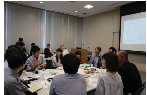
〈 Participants discussing in a free and open-minded manner during the group discussion 〉