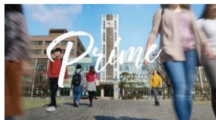
〈 Top page of the website of the Top Global University project 〉