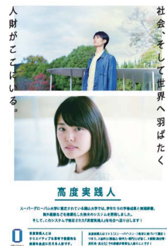
〈 Pamphlet about high-level practical-oriented human resources 〉

In academic year 2016, we introduced 60-minute classes and four-term system. After reviewing our entire educational system, we newly established the Institute for Education and Student Services. Also, striving to promote integrated educational reforms, we reviewed and refined the 60-minute classes and four-term system toward their improvement in academic year 2017, and improved our liberal arts subjects. Furthermore, as part of the PRIME Program, which aims to develop practical-oriented human resources, we established a system to certify high-level practical-oriented human resources.