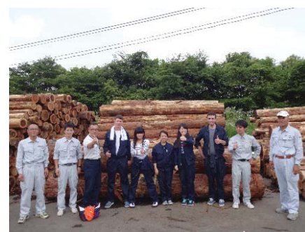
〈 Implementation of Co-op program with UBC students 〉

As for practical education subjects for society-academia collaboration, 13 subjects were provided as a liberal arts trial, and about 60 subjects will be fully introduced for liberal arts and about 50 subjects for technical training from academic year 2016.