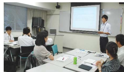
〈 Learning group of young employees 〉

By adding Problem-Based Learning (PBL) elements to existing training programs for newly employed faculty and staff members and for section managers and assistant managers, we expanded opportunities to develop planning and communication skills for the University reform. Moreover, with regard to a learning group of young employees set up since academic year 2012, an advanced learning group of young employees has been set up to further improve the skills of participants in academic year 2012 and 2013.