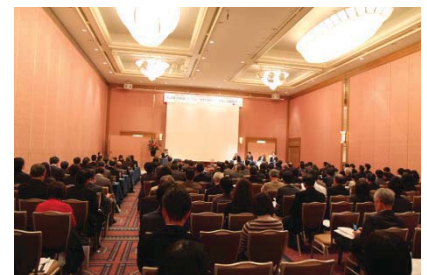
〈 Symposium for collaboration between the industry, government and university 〉

We also drew up a draft definition of the practical social collaborative education program, decided test subjects to be implemented in academic year 2015 and compiled a draft plan for subjects to be taught in academic year 2016. In the future, we will examine all subjects based on results of self-monitoring on the program, and fully introduce it in academic year 2016.