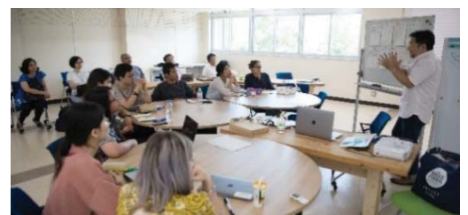
〈 SiEED Program experimental class 〉