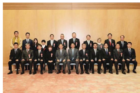
〈 Award ceremony at the Prime Minister's Official Residence 〉