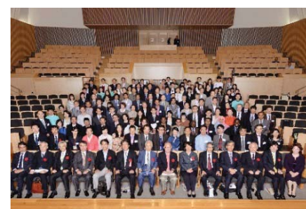
〈 Holding of Super Global Day 〉

As a new endeavor for the purpose of promoting globalization and international exchange activities, Okayama University Super Global Day 2015 was held. Over 400 people from Japan and overseas participated, including alumni from overseas, and socialized with each other.