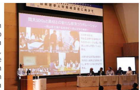
〈 At a panel discussion 〉