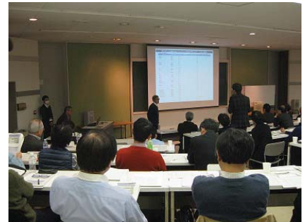
〈 Training camp session for department heads and others 〉

In addition to the Department Heads Training Session which is held annually, the Faculty of Engineering held a training workshop for teachers to improve their minds for university reforms.