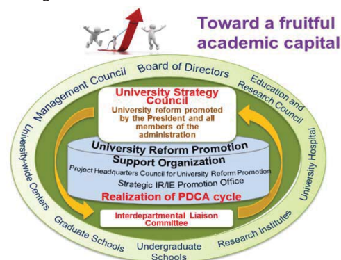
〈 University reform promotion system based on objective management 〉