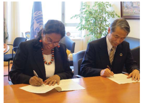
〈 Signing MoU with UNCTAD 〉

Based on this MoU, with a view to contributing to the STI for SDGs promoted by the UNCTAD, Okayama University will provide two human resource development programs: a short-term program (joint research/training courses for young female scientists from developing countries) and a long-term program (PhD program for young scientists from developing countries). The University will use the conclusion of the MoU as an opportunity to further its efforts for human resource development for STI for SDGs and spread them to the world while disseminating related information at home and abroad, in cooperation with the UNCTAD, one of the main UN organs implementing the framework.