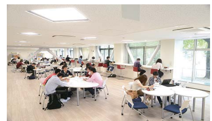
〈 Learning commons 〉

After aseismic renovation works of the Central Library and the Shikata Branch Library, we secured spaces for self-directed learning such as learning commons, a seminar room, and a group-learning room in both buildings. Thanks to the effects of the new facilities and various events including pilot classes aimed at developing education programs to foster students' critical thinking skills and to enhance their communication ability through Finnish interactive techniques, among other reasons, the number of visitors to the Central Library increased by about 1.5 times from a year earlier to 451,894 in academic year 2014.