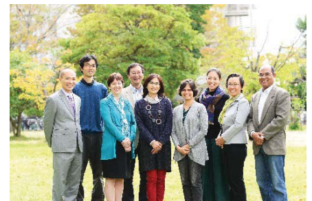
〈 Faculty members of the Discovery Program for Global Learners 〉