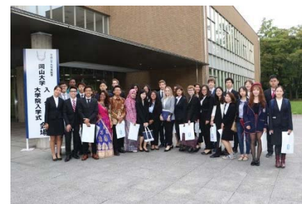
〈 The first batch of students in the Discovery Program for Global Learners in front of the entrance ceremony venue 〉

After further discussion on how to operate the graduate school, we set up seven working sections and working groups under the New Graduate School Establishment Preparation Committee. Thus, we prepared thoroughly for the establishment of the graduate school in April 2018, discussing an enormous amount of issues, including how to build an operating structure for the new graduate school, how to implement public relations activities through the university's website or other means, how to design systems for educational affairs, entrance examinations, and student life, and how to develop practical training programs in advanced hospitals.