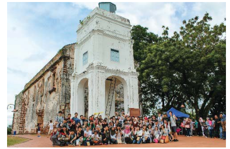
〈 Office workers sent on a training program in Malaysia 〉