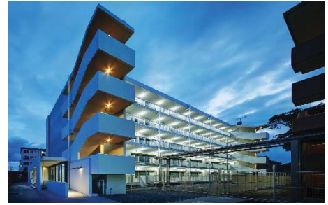
〈 International Student Shared House 〉

In March 2016, a shared house, where 120 students (30 Japanese students and 90 international students) can live together, was completed. Living together with other students may improve mutual cultural understanding, cooperation, and learning from each other. This shared house is expected to be a place that may increase students' motivation in language learning and encourage international exchange and studying abroad.