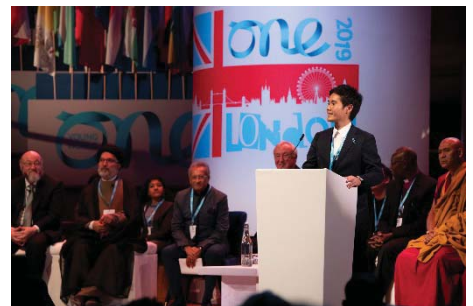
〈 Taking the platform in the plenary session 〉

Two students from Okayama University participated in "One Young World Summit 2019" in London, the United Kingdom, as members of the Japan team. Of them, one student was selected as one of the representatives of world youth in the plenary session titled "One Young World Interfaith Dialogue" and took the platform together with incumbent leaders. He was the third Japanese person and the first Okayama University student selected to go onto the platform.