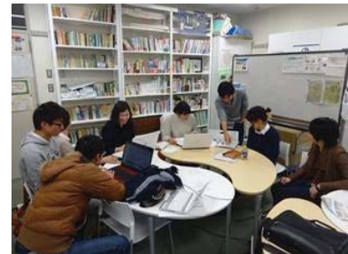
〈 Support by help staff 〉

Orientations are separately provided in Japanese and English. We increased guidance information on matters necessary for students' daily lives, such as explanations about the university co-op and cell phones. We also enhanced the contents of support for international students to smoothly provide assistance for them after arrival through the help of resident assistants at the university's dormitories, students assigned as help staff and others.