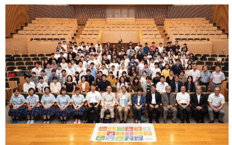
〈 Kickoff meeting held 〉

In addition, the University newly established a system to assign individuals or organizations supporting SDGs promotion activities as Okayama University SDGs Ambassadors. There have so far been 133 SDGs Ambassadors under this system. Furthering this SDGs Ambassadors initiative will hopefully help the University's SDGs promotion efforts gain further momentum.